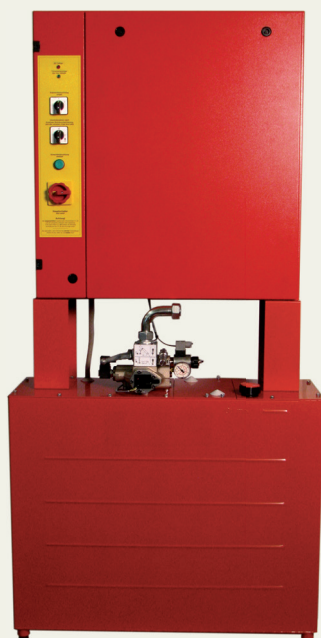
Power unit with iValve and control cabinet